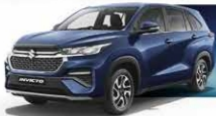
NEXA BLUE (CELESTIAL)