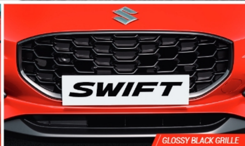
GLOSSY BLACK GRILLE