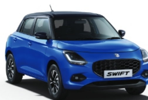
/ Luster Blue with Bluish Black Roof