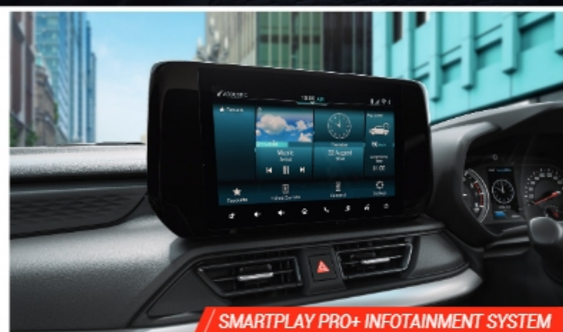
SMARTPLAY PRO+ INFOTAINMENT SYSTEM

No words can describe what you'll feel when you enter the Epic Swift. But we'll try. This car is designed with ample space keeping your comfort in mind and its Sporty All-Black Interiors make every drive truly stylish. The real head-turner is the sleek and futuristic center console, with a driver-oriented cockpit for easy access.