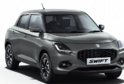
/ Magma Grey