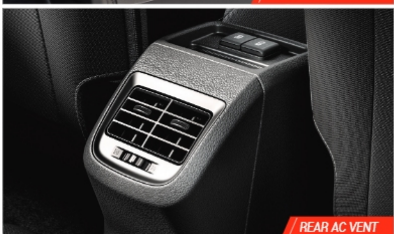
REAR AC VENT