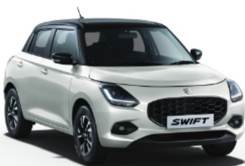
/ Pearl Arctic White with Bluish Black Roof