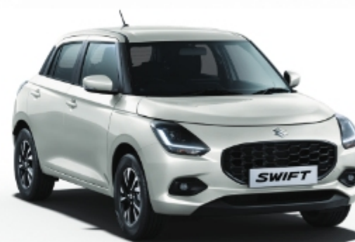
/ Pearl Arctic White