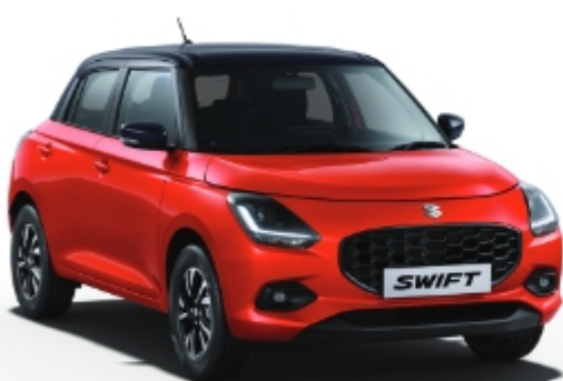
/ Sizzling Red with Bluish Black Roof