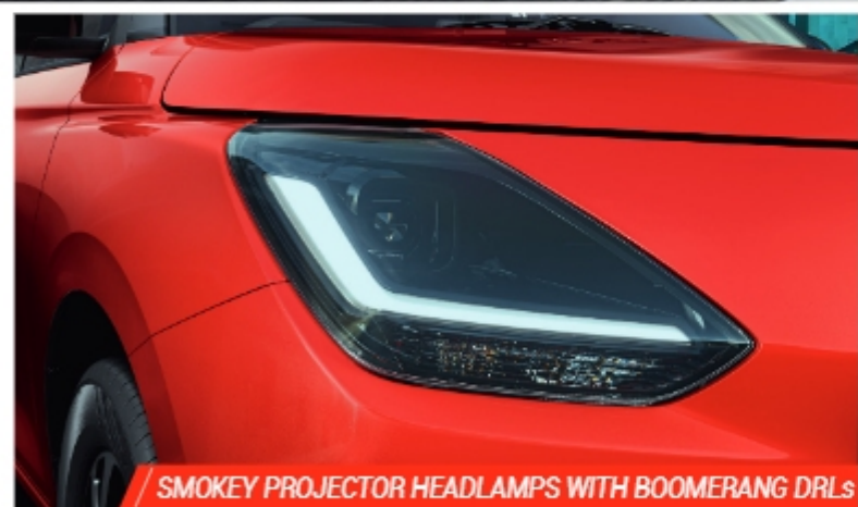
SMOKEY PROJECTOR HEADLAMPS WITH BOOMERANG DRLs

With its bold stance and sporty design, the Epic Swift is quite the looker. It is pure passion crafted into an expression of thrill. As it approaches, heartbeats go up, and you know it is something special.