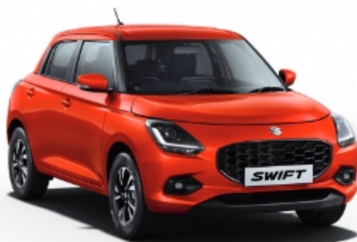
/ Novel Orange 11