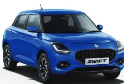
/ Luster Blue 11