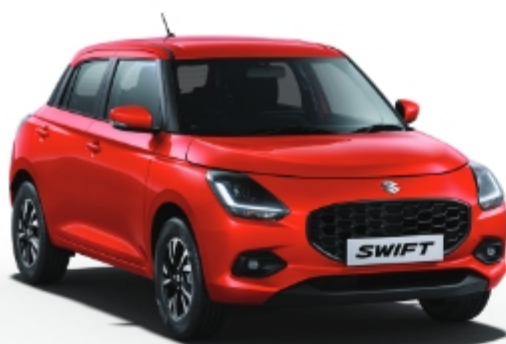
/ Sizzling Red 11