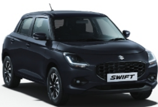
/ Bluish Black 11