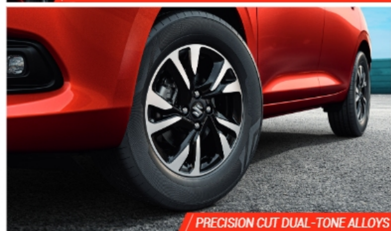
PRECISION CUT DUAL-TONE ALLOYS